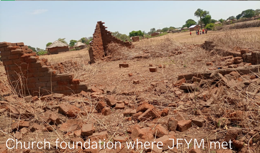
Church foundation where JFYM met