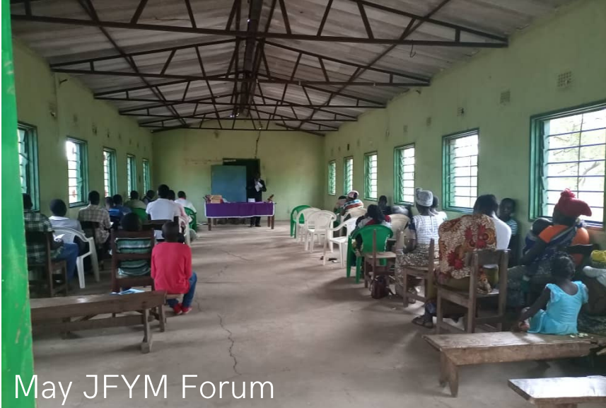
May JFYM Forum