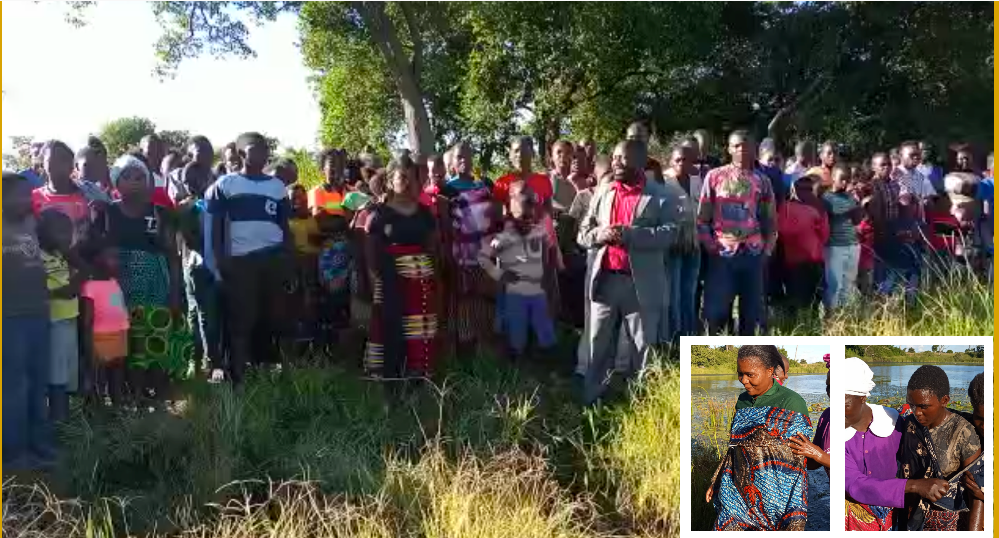
Baptisms for the crowds

Here is a picture from a church plant that took place in February.