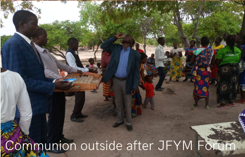
Communion outside after JFYM Forum