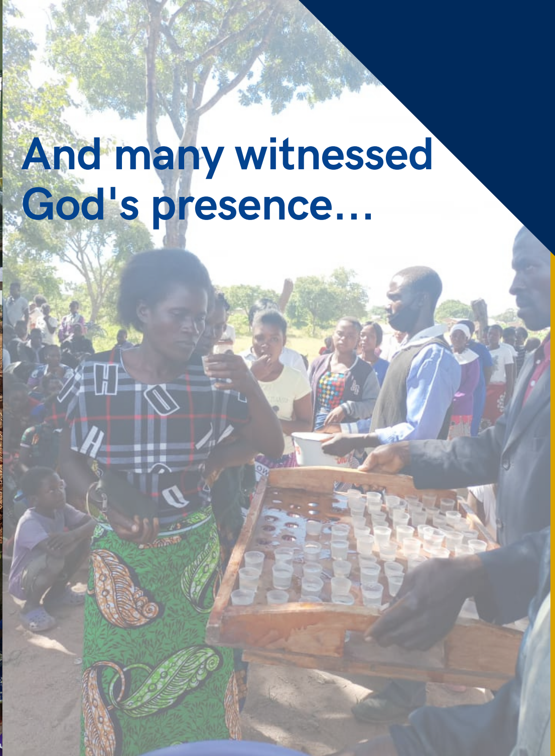
JFYM graduates taking communion after forum