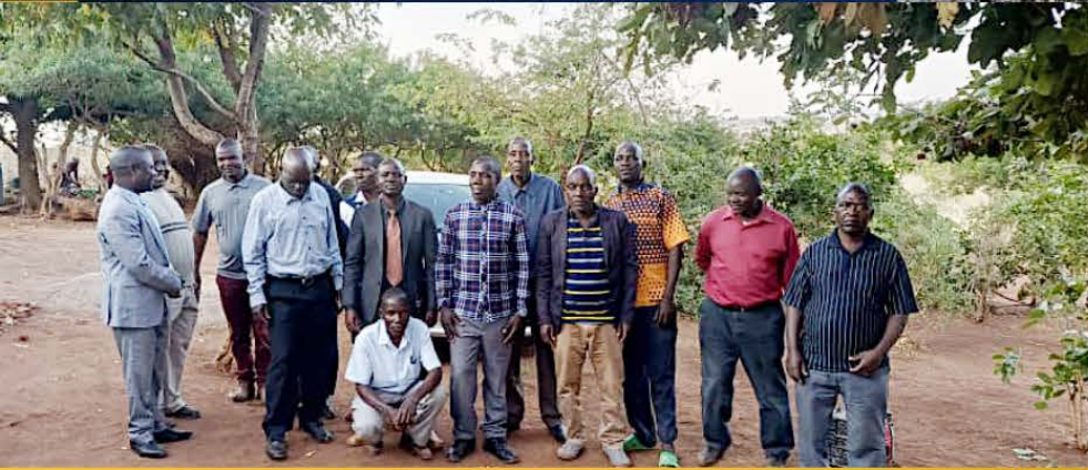
Chiefs and headmen of local tribes who are now trained in JFYM!