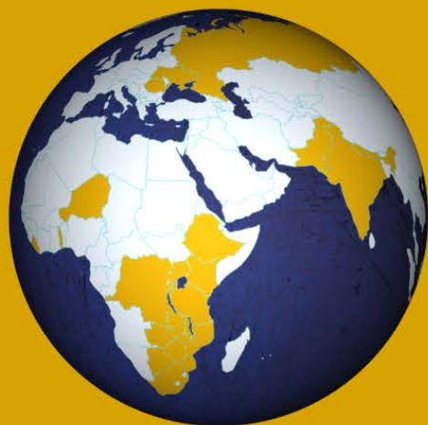
Reach Out Global Map

God moved mightily through our Reach Out team in 2023, more than we ever could have imagined! Investing into the training and equipping of youth leaders is crucial in spreading the message of the gospel to the younger generation. Our Country Leaders witnessed God's hand in allowing our team to train and equip more than 5,000 youth leaders this past year who are now implementing the six essential characteristics taught through Jesus-Focused Youth Ministry into local churches in countries all over the world. Accounts were received about the impact of our JFYM Forums that brought newly certified Eagle Leaders (leaders who are now equipped to train other leaders), churches planted, and onlookers saved. Over 18,000 students were saved through the ministries of those trained in Jesus-Focused Youth Ministry . And thousands more are currently being disciplined into disciple-makers for their generation!