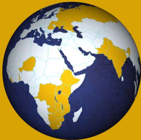
Reach Out Global Map

God moved mightily through our Reach Out team in 2023, more than we ever could have imagined! Investing into the training and equipping of youth leaders is crucial in spreading the message of the gospel to the younger generation. Our Country Leaders witnessed God's hand in allowing our team to train and equip more than 5,000 youth leaders this past year who are now implementing the six essential characteristics taught through Jesus-Focused Youth Ministry into local churches in countries all over the world. Accounts were received about the impact of our JFYM Forums that brought newly certified Eagle Leaders (leaders who are now equipped to train other leaders), churches planted, and onlookers saved. Over 18,000 students were saved through the ministries of those trained in Jesus-Focused Youth Ministry . And thousands more are currently being disciplined into disciple-makers for their generation!