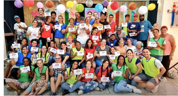
150+ children and 50 volunteers helped at the Almendares Church summer VBS in CUBA [top].

And just a couple of weeks later, our team hosted the annual RESET summer camp for teens. They were creative having access to minimal supplies, like bucks, tarps, rope, and glow-in-the-dark paint. None of this stopped them from having a blast. A pivotal moment at the retreat was when the students washed each other's feet just as Jesus did with His disciples. Most of them were extremely emotional, recognizing the significance and intimacy that comes from doing this with one another.