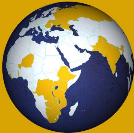
Reach Out Global Map

God moved mightily through our Reach Out team in 2023, more than we ever could have imagined! Investing into the training and equipping of youth leaders is crucial in spreading the message of the gospel to the younger generation. Our Country Leaders witnessed God's hand in allowing our team to train and equip more than 5,000 youth leaders this past year who are now implementing the six essential characteristics taught through Jesus-Focused Youth Ministry into local churches in countries all over the world. Accounts were received about the impact of our JFYM Forums that brought newly certified Eagle Leaders (leaders who are now equipped to train other leaders), churches planted, and onlookers saved. Over 18,000 students were saved through the ministries of those trained in Jesus-Focused Youth Ministry . And thousands more are currently being disciplined into disciple-makers for their generation!