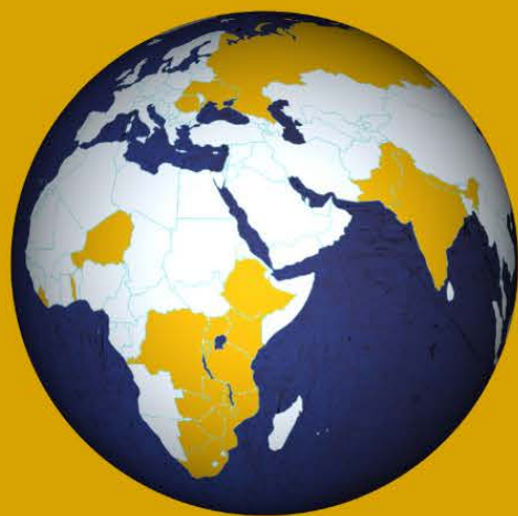
Reach Out Global Map

God moved mightily through our Reach Out team in 2023, more than we ever could have imagined! Investing into the training and equipping of youth leaders is crucial in spreading the message of the gospel to the younger generation. Our Country Leaders witnessed God's hand in allowing our team to train and equip more than 5,000 youth leaders this past year who are now implementing the six essential characteristics taught through Jesus-Focused Youth Ministry into local churches in countries all over the world. Accounts were received about the impact of our JFYM Forums that brought newly certified Eagle Leaders (leaders who are now equipped to train other leaders), churches planted, and onlookers saved. Over 18,000 students were saved through the ministries of those trained in Jesus-Focused Youth Ministry . And thousands more are currently being disciplined into disciple-makers for their generation!